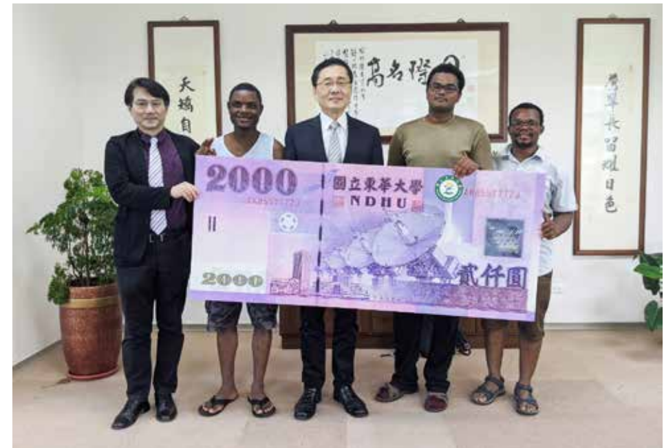
▲ Scholarships for outstanding foreign academic performers, facilitating international educational communication.